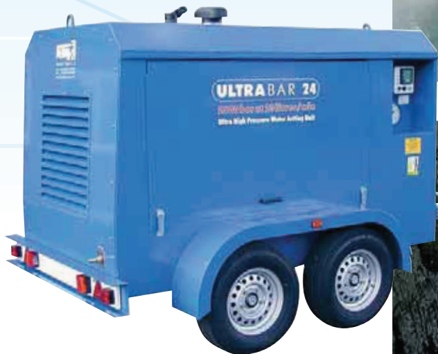
Ultra Bar 24 diesel road trailer. Same chassis used for any pressure / flow combination between 75 & 150 kW (100 & 200 hp)

Every unit manufactured by Airblast is robust, simple to operate and maintain, and designed for longevity. Diesel engines and electric motors are sourced from world leading manufacturers and comply with the latest international standards. Simple control panels are used