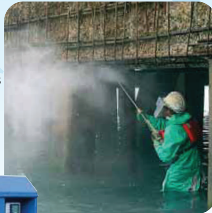
Concrete cutting - 1000 bar

High capacity water filters and stainless steel suction line fittings are used as standard and boost pumps fitted for higher pressure applications. Shutdown switches are fitted where necessary to monitor various pump and prime mover functions.