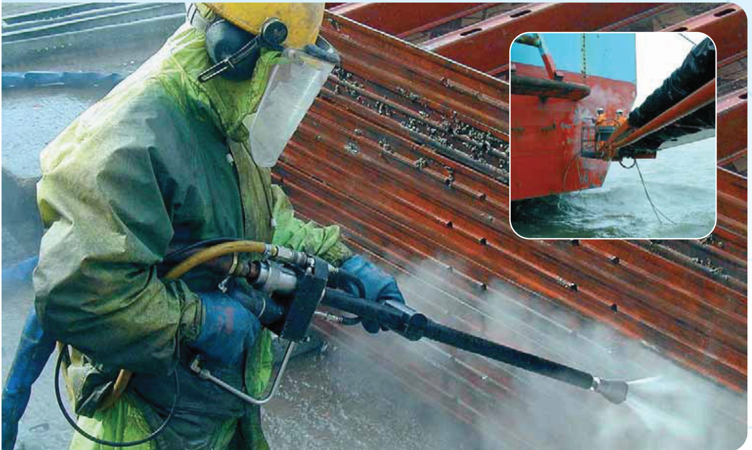
Main Picture : Stripping concrete from formwork at 2500 bar inset : Surface preparation, shiprepair at 2750 bar