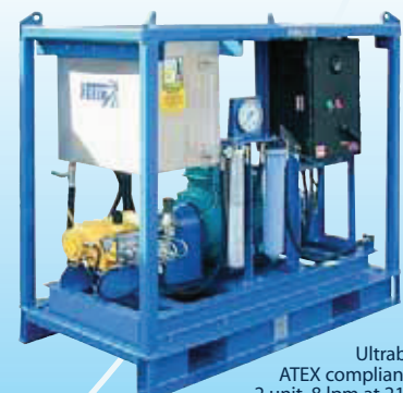
Ultra Bar 10, ATEX compliant Zone 2 unit, 8 lpm at 2100 bar

Backed by a comprehensive spares stockholding, we have dedicated Service Engineers who travel nationally and internationally keeping our pumps running round the clock. We also work closely with our overseas agents who have been trained in the selection, operation and maintenance of our product range ensuring they can provide the vital after sales service demanded by today's fast moving industry.