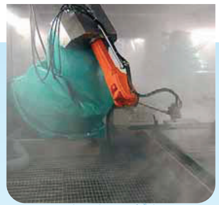
Robotic cleaning of skids at automotive plant - 900 bar.