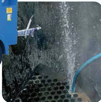
Heat exchanger cleaning - 800 bar