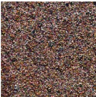
Rust Grade D