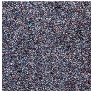
C HB2 Rust Grade C Hydroblasted to an Sa2 equivalent