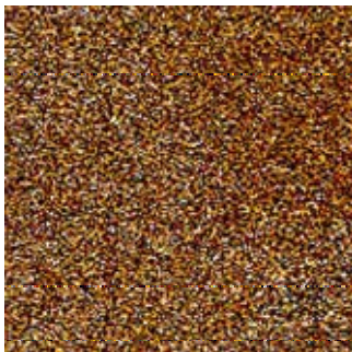
Rust Grade C