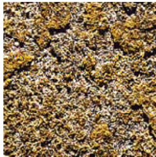
Rust Grade D