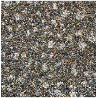
D HB2 L Light Flash Rusting