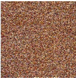
Rust Grade C