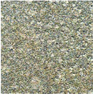
C HB2 L Light Flash Rusting