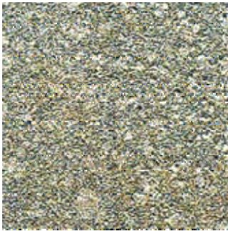
D HB2½ L Light Flash Rusting