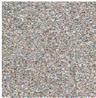
C HB2½ Rust Grade C Hydroblasted to an Sa2½ equivalent