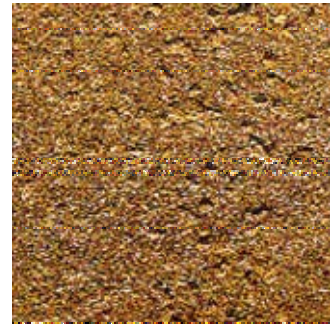
D HB2½ H Heavy Flash Rusting