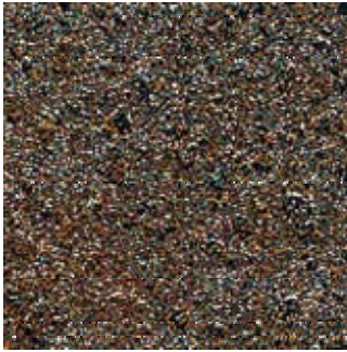
Rust Grade D