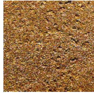
C HB2 H Heavy Flash Rusting