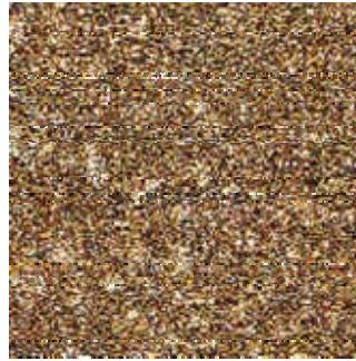
D HB2 M Medium Flash Rusting