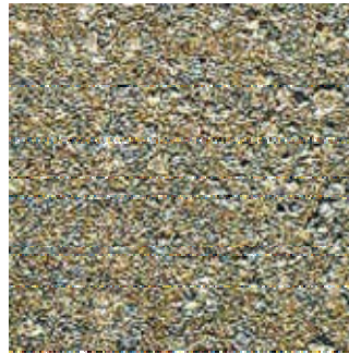
D HB2½ M Medium Flash Rusting