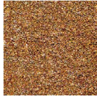
D HB2 H Heavy Flash Rusting