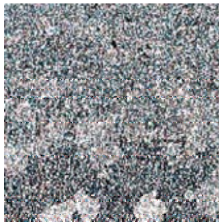
D HB2 Rust Grade D Hydroblasted to an Sa2 equivalent