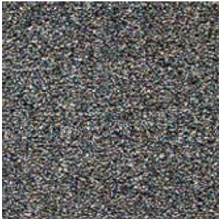
C HB2½ L Light Flash Rusting