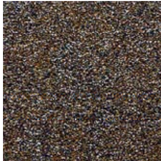
C HB2½ M Medium Flash Rusting