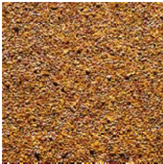
Rust Grade C