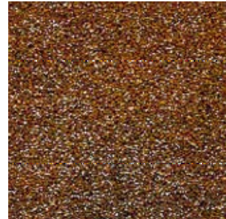
C HB2½ M Heavy Flash Rusting