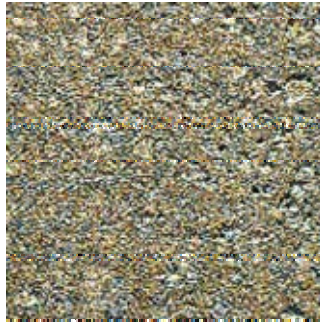
C HB2 M Moderate Flash Rusting